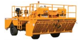
CSM - CSH Chip Spreader