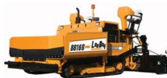
8816B Asphalt Paver