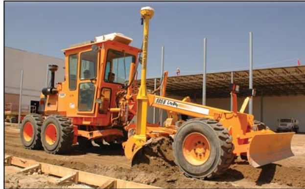
Pictured with customer-mounted Trimble GPS system.

The 685B Motor Grader is designed to deliver power, performance and durability at the jobsite. Whether building a road, cutting a ditch, preparing a work site or doing fine grading, the LeeBoy 685B Motor Grader is a versatile workhorse and features operator comfort and safety, easy control, and trouble-free operation.