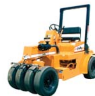
420 Pneumatic Roller