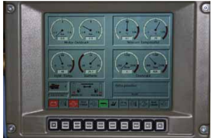
Board Control System

Cat hydraulic shovels are equipped with retractable access ladders. A less steep 45° folding stairway is available as an option. An exit harness kit or a kick-down type, cage-equipped ladder allows for safe egress in case of emergency.