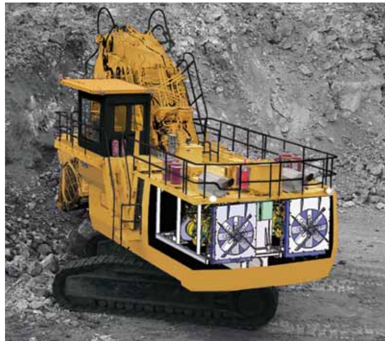
Diesel engine drive system