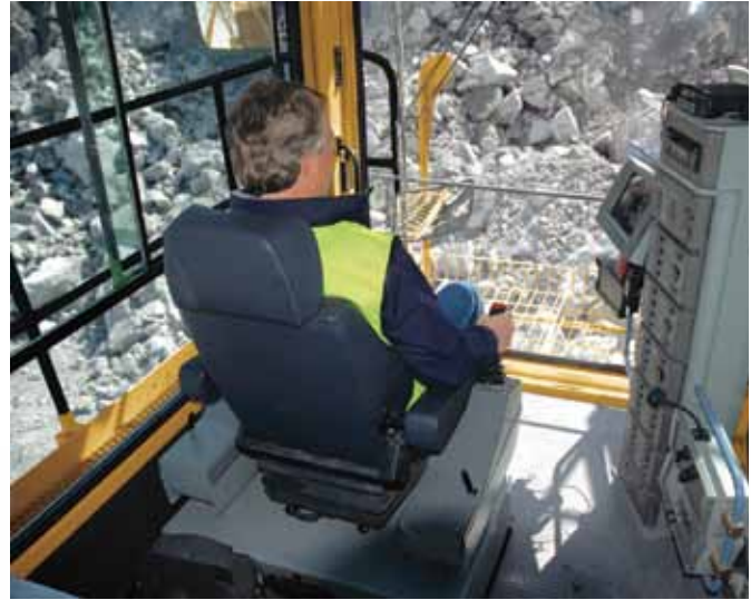
Safe, comfortable cab design