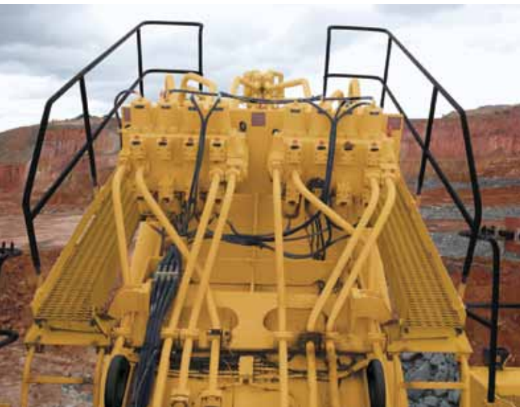
Main hydraulic valve block