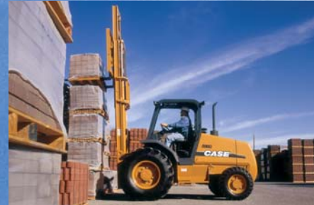
Fast Lift Speed