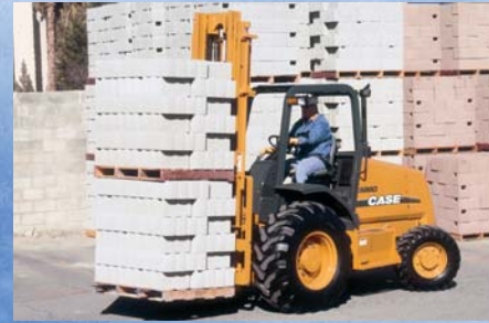
Narrow Turning Radius

© 2005 CNH America LLC Case is a registered trademark of CNH America LLC Any trademarks referred to herein, in association with goods and/or services of companies other than CNH America LLC, are the property of those respective companies. All rights reserved. Printed in U.S.A.