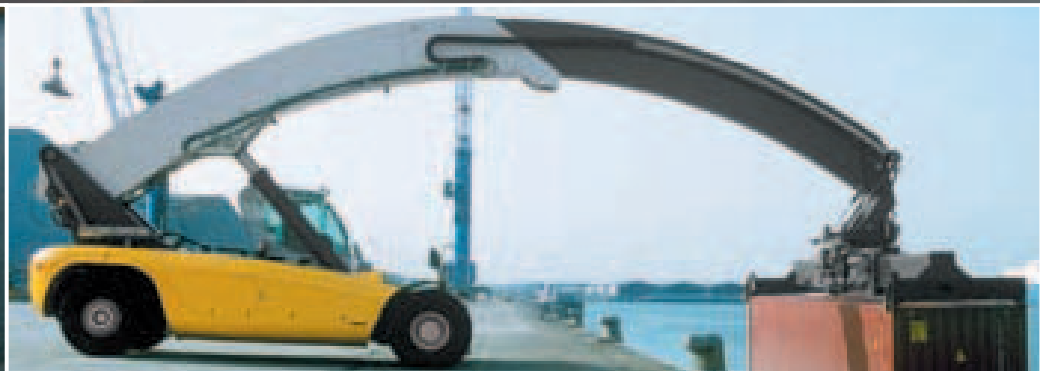
Supporting pads for increased lifting capacity in the second and third row (option).