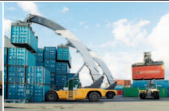
Outstanding handling possibilities for utmost efficiency.