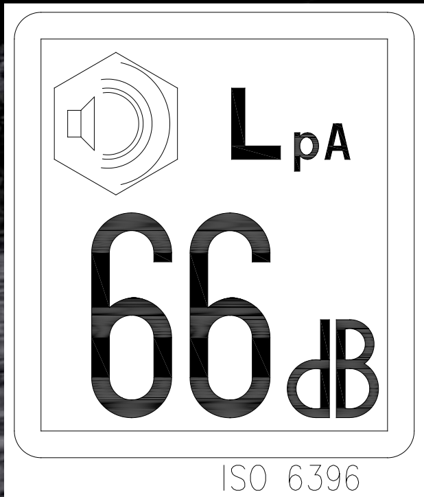
Noise level cab for 906E / 908E

- The new Hydrema E-Series has world wide the lowest noise level in the cab for loader / excavators !