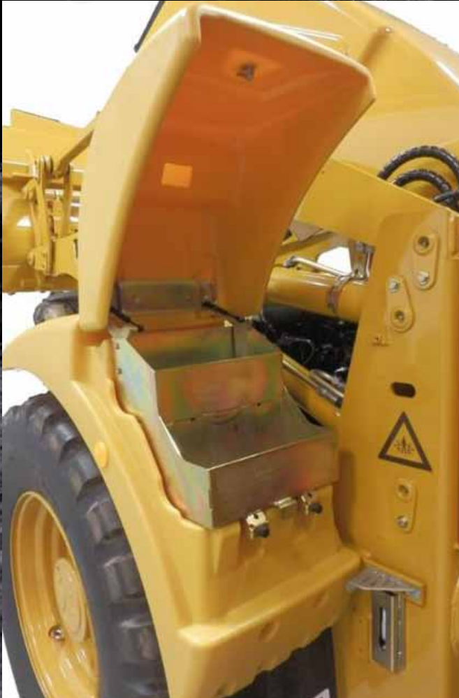
Integrated tool boxes