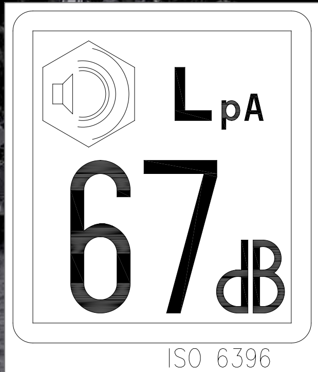
Noise level cab for 926E / 928E